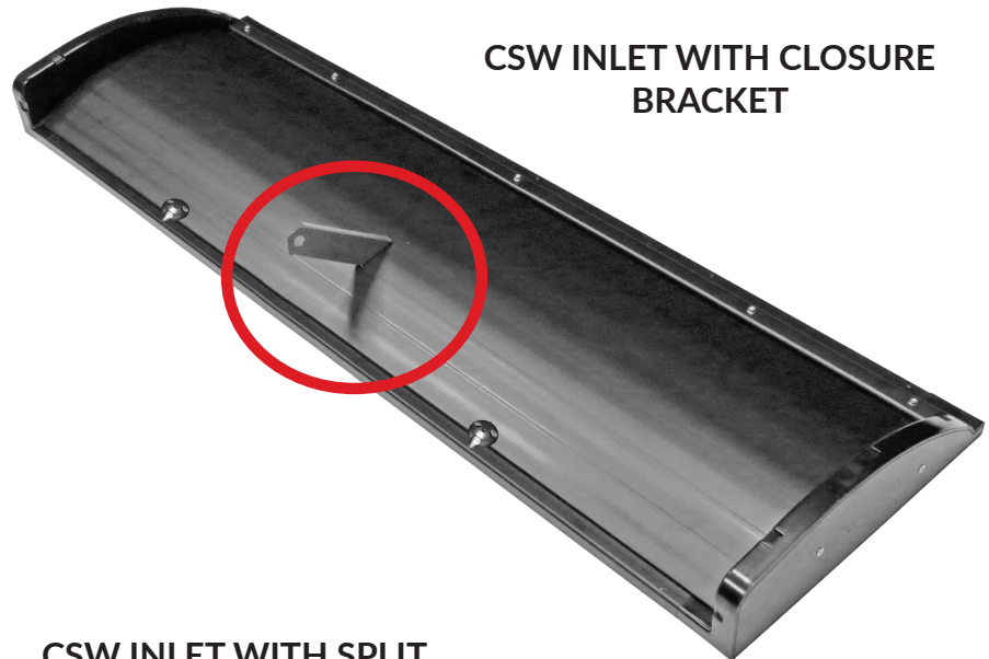
CSW INLET WITH CLOSURE BRACKET